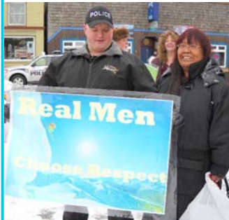
"Real Men Choose Respect"