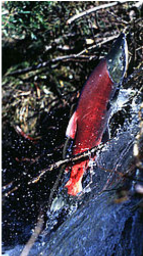
Sockeye - jumping over a beaver dam