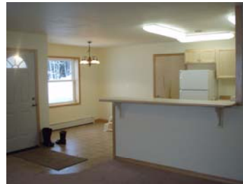
Main entrance - kitchen (with dishwasher) and dining room.