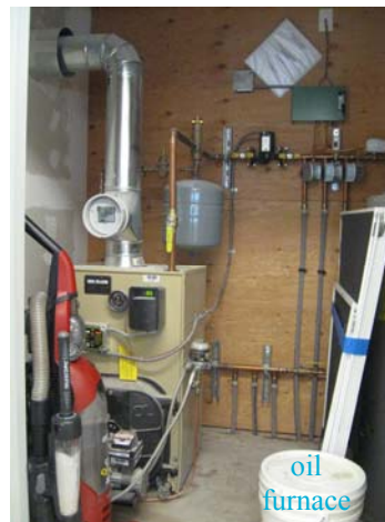
Garage with the furnace room off the corner of the garage.