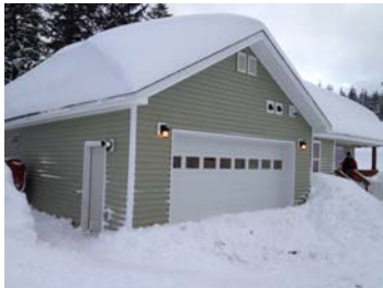
Garage with paved drive way